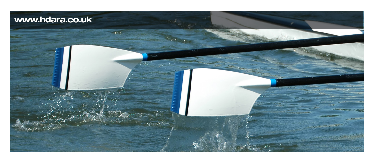
South Coast Championship Regatta Venues & Championship Winning Clubs